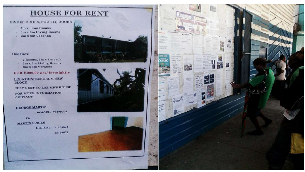
Plate 1: General notice board in Boroko (Port Moresby) and Lae top town for informal rental housing advertisements

In many informal rental markets, rental units are rarely advertised, and potential renters will find accommodation through social networks like friends and relatives (Gunter, 2014). This means that the rental charges are difficult to standardise, and rental amounts will vary across a city or even across a settlement. As in the formal rental market, rents will rise with location, size of dwelling and quality of the structure (Gilbert, 2003). According to Endekra et al. (2015), houses informally developed in unplanned areas are often advertised mainly for rent.